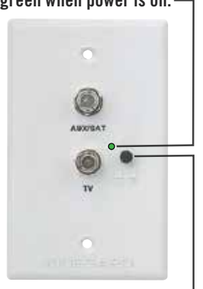
Power button -

Power indicator light is green when power is on.